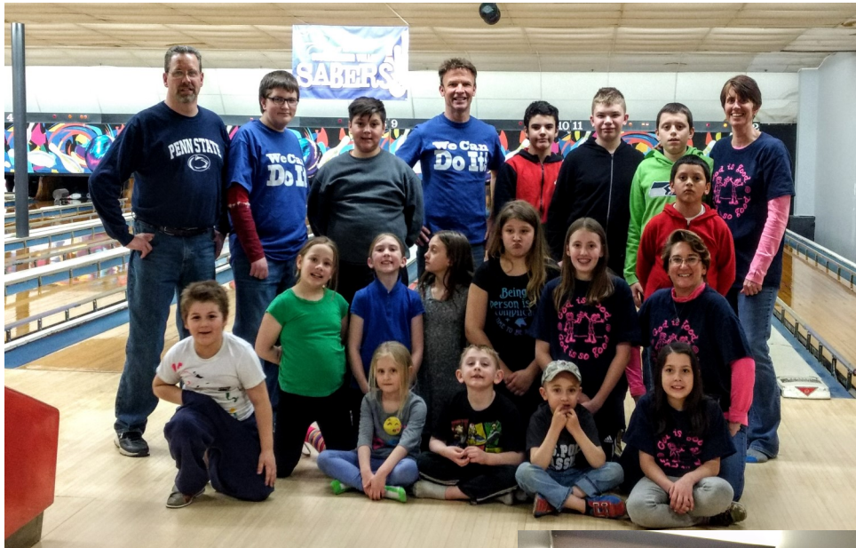
Game On went on the road for a night out of bowling and pizza. We started the night at Blue Stone Pizza in Hallstead.