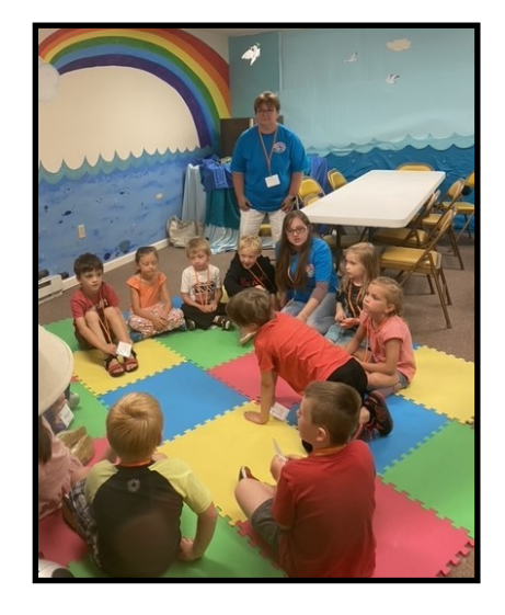
Day 4: Ripple Effect – God can Help you Change the World Around you.