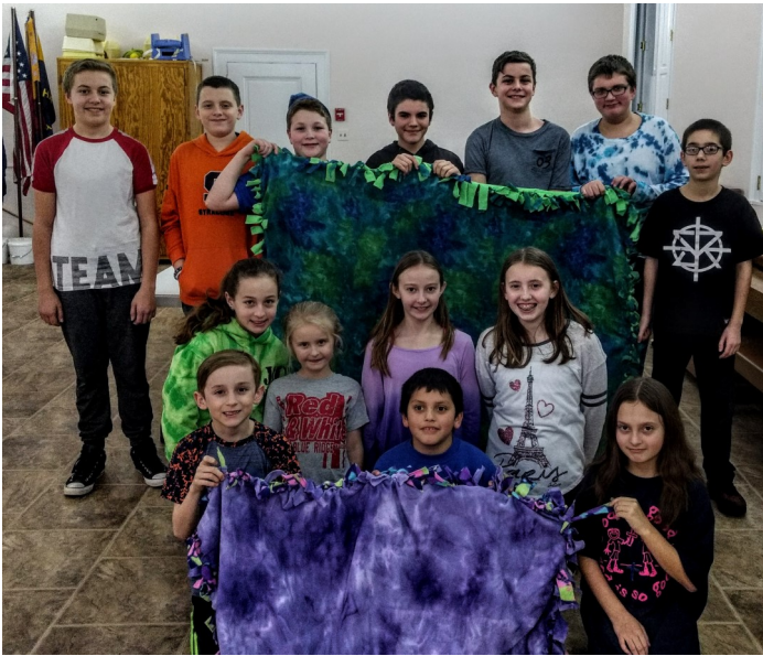
Making Comfort Blankets