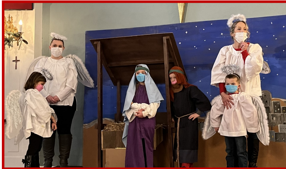
Mary, Joseph, Baby Jesus and a Heavenly Host of Angels