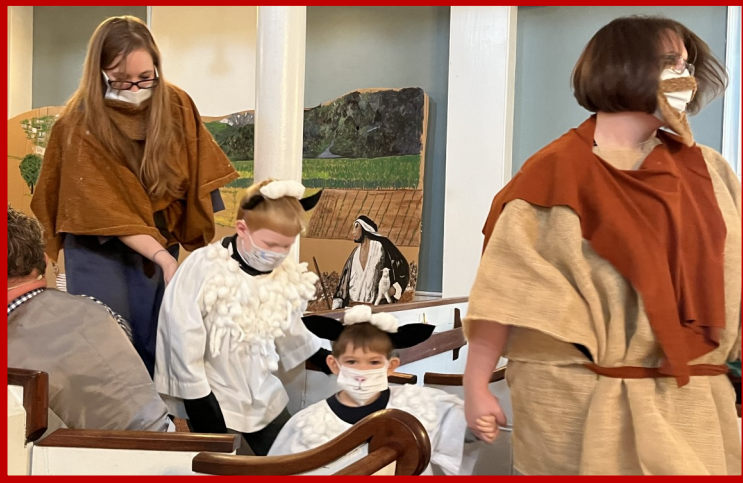
The Shepherds went to Bethlehem to see the baby Jesus