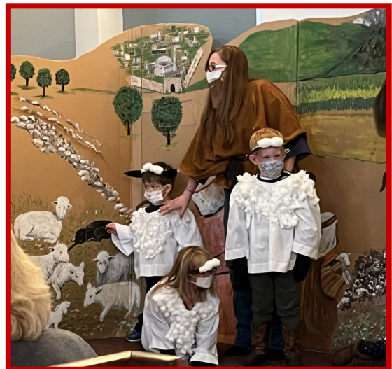
Shepherds keeping watch over their flocks