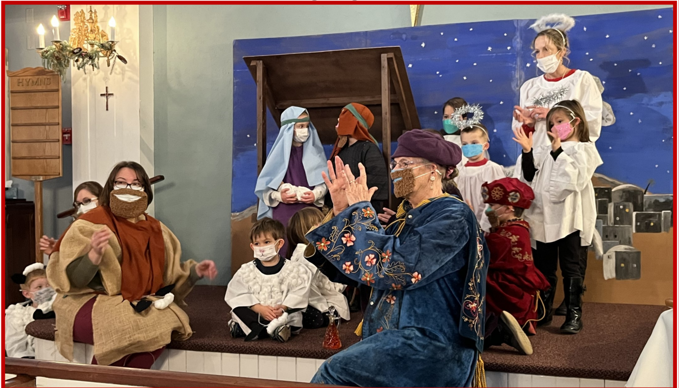
All the children sang Jesus Love Me and used sign language