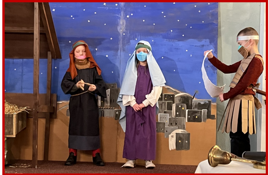
Mary, Joseph and the Centurion